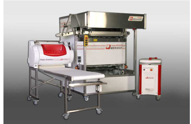
Semi-automatic group : Divider + Intermediate Proofer + Moulder + Discharge belt.

To find easily the first intermediate proofer loaded so as to set up in the emptying position..